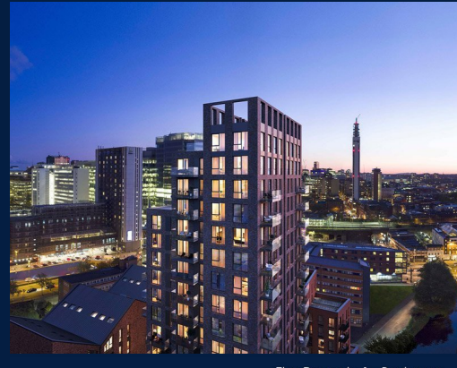
The Regent: 1 - Bedroom