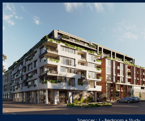
Spencer: 1 - Bedroom + Study