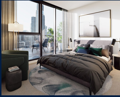
Roden: 3 - Bedroom